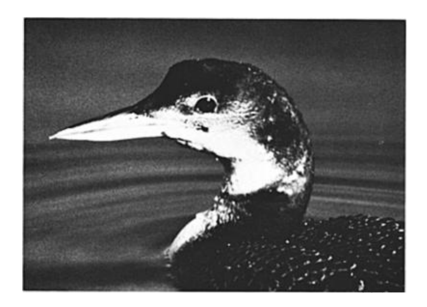
Figure 2. Common Loon in gray-brown plumage. Note the following and compare with Figure 1: Mostly dark culmen; decurved lower outline of mandibular ramus; dark posterior auricular region and neck sides, rather sharply defined from white of underparts and not seeming to reduce width of occiput and hindneck; moderately dark face, with dark lores and postocular region; no discrete auricular patch (dark area in this photograph is more posterior and merges with dark occiput); large eye; thin neck with proportionately large head. Photographed at Oxnard, Ventura Co., California on 12 February 1970.

The important fact to note here is that in all ages and plumages of the Common Loon, black covers the entire culmen from base to tip (or to within 3-4 mm of the tip) and extends ventrolaterally for several millimeters. In adamsii the distal half or more (usually the distal two-thirds) of the culmen is pale, and only the basal portion is dark; gradation between the two colors is even and is always completed basally to