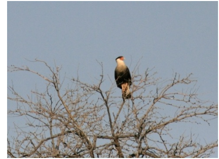
Adult Crested Caracara

Typically this species does not wander far from its nesting grounds, even in the winter, so the question is: Are they nesting in this area? The objective of this AZFO Field Expedition was to determine if caracaras are nesting on the Santa Cruz Flats, which would document a northward expansion of their nesting range. For the past 50 years, the only part of the state where they have been documented regularly nesting is on the Tohono O'odham lands in southwestern Pima County. In Arizona, nest building for caracaras begins mid-March, and nests are typically built in saguaros ( Carnegiea gigantea ).