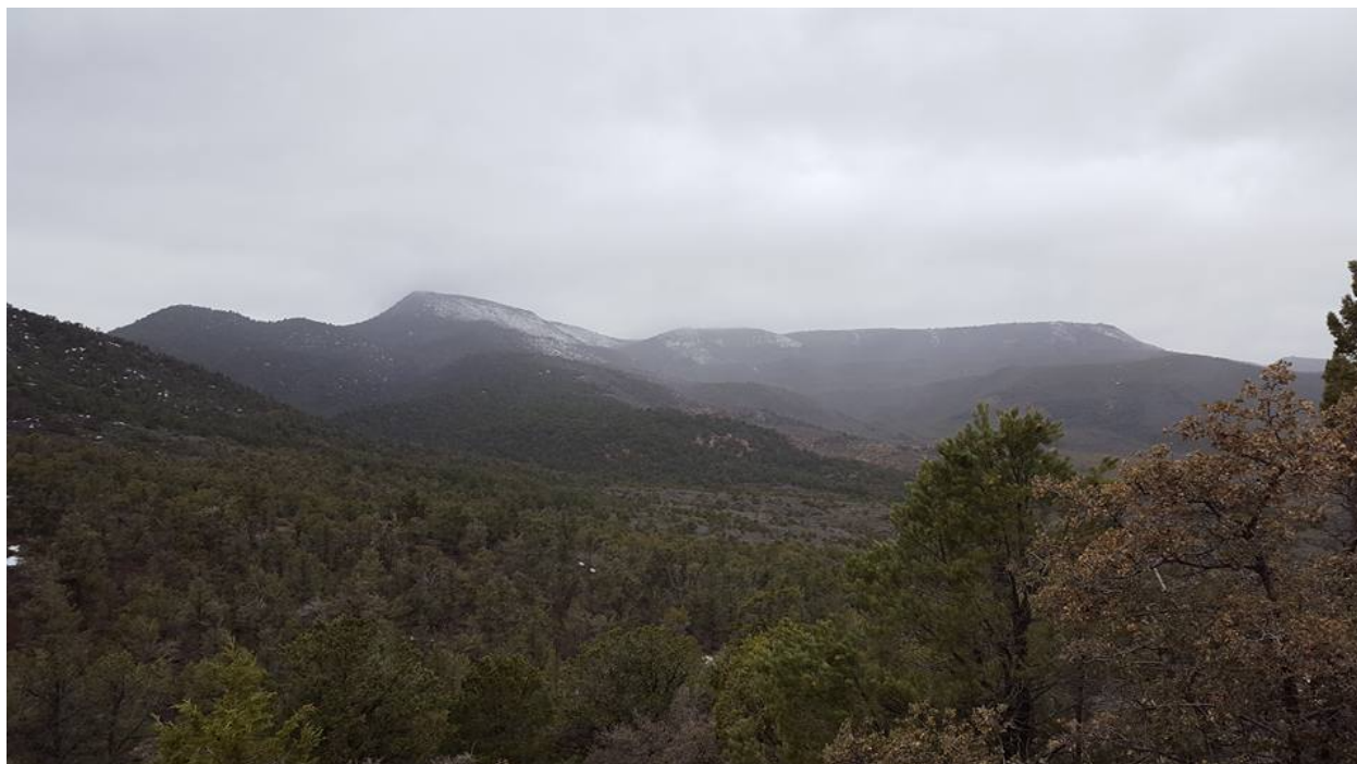
Black Rock Mountain with dusting of snow.