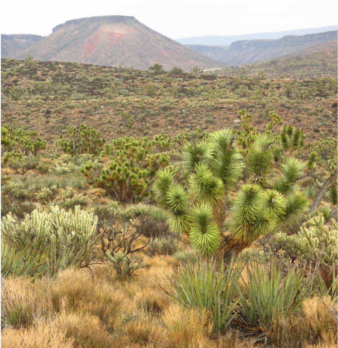
Mojave Desert scrub near the Virgin River.