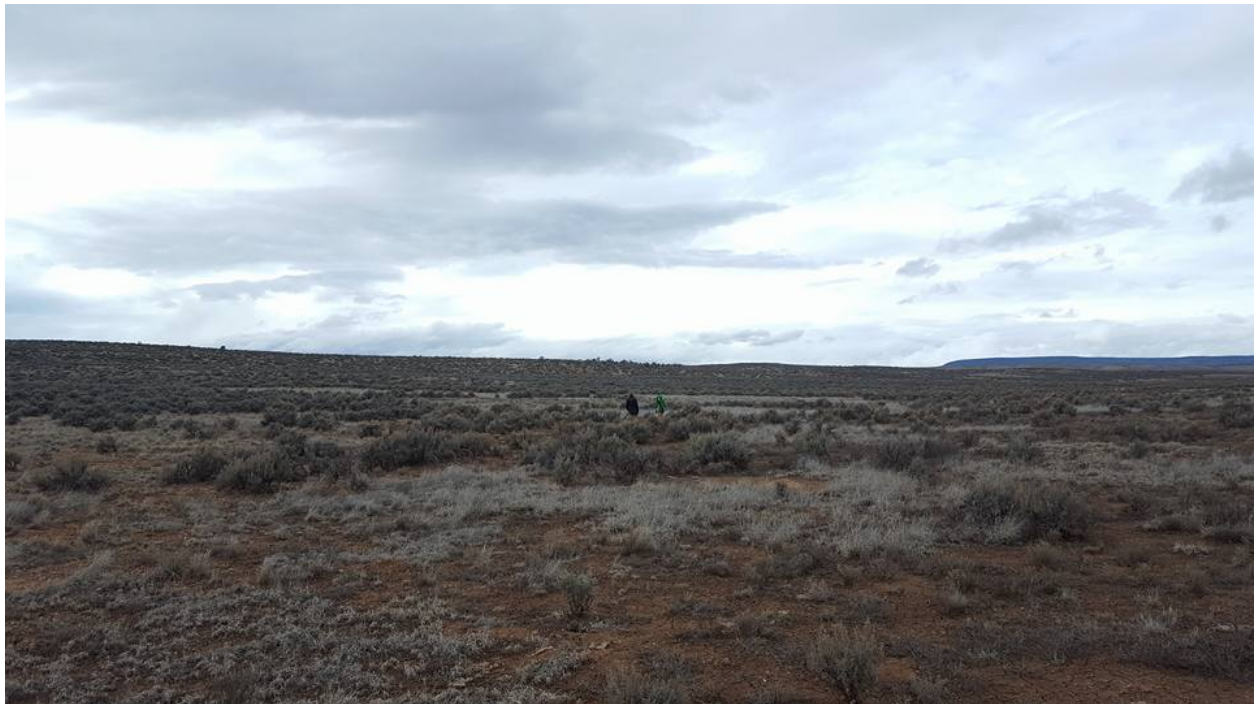
Birding the sagebrush of Main Street Valley.

intersection of BLM road 1004 and BLM road 1009. This location had an interesting mix of chaparral, Gambel oak, some riparian shrubs, and pinyon-juniper woodland. Despite the rain, the location had good numbers of expected species, but a singing Crissal Thrasher at its upper elevational limit and a “ Slate-colored ” Junco were of interest. Descending back into the lowlands, we headed over Wolfhole Pass where we had an early migrant or overwintering Sage Thrasher . Checking the sagebrush steppe and grassland habitats of Main Street Valley, we had good numbers of Horned Larks , but a Prairie Falcon kept us from checking this flock for longspurs. Heading back, we made another stop in the pinyon-juniper woodlands where we had another Dark-eyed Junco flock which included a “Slate-colored”.