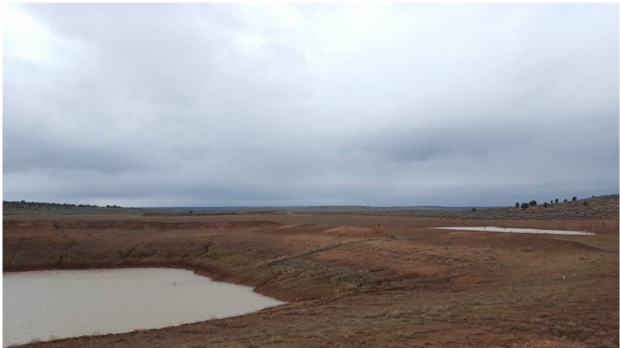
Tanks in the Wolfhole Valley.