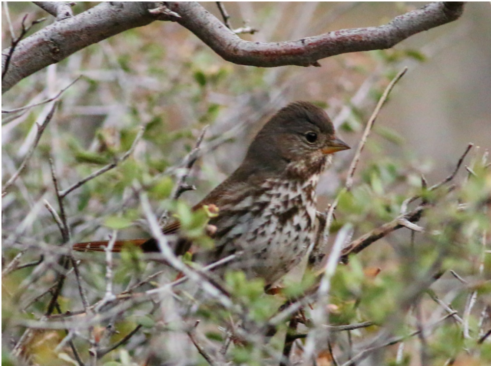
‘Slate-colored’ Fox Sparrow.