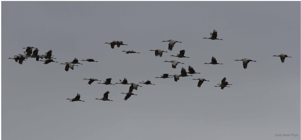
Sandhill Cranes.