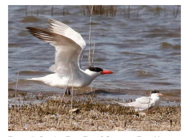
Figure 7. Caspian Tern (I) and Common Tern (r). 30 August 2017.

Six species of terns and seven of gulls have also been reported from San Carlos Lake (Figure 7). The Arctic Tern in 2010 was only the sixth record for the state. High numbers of 15 Caspian Terns, 7 California Gulls, and 150 Ring-billed Gulls have been reported, and it is often a good place to view migrant Franklin's and Bonaparte's gulls during the proper season. The lake can also be an excellent place to view shorebirds, though viewing conditions vary greatly with the water level. Lower levels result in sandy spits, islands, and more rarely extensive mudflats, which attract a wide variety of shorebirds and waders. In addition to those previously mentioned, the list of "rare-but-regular" shorebirds observed includes both Sanderling and Black-bellied Plover. Conditions can be good during spring migration, but the best shorebirding is usually encountered from August to November.