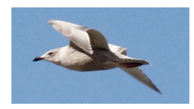
Figure 4. Iceland (Thayer's) Gull. 8 Nov 2017.

According to the Arizona Game and Fish Department, there are several Bald Eagle nests in the general vicinity of the lake (pers. comm. J. McCarty), and eagles are seen foraging on most visits year-round (Figure 5). Wintering and migrant Ospreys are expected from fall through spring, but have also been observed in midsummer. In some years, Great Blue Heron and cormorant rookeries have been reported near the lake. For most of the 2000s, Double-crested Cormorants were by far more numerous, but in the last five or six years, reports and numbers of Neotropic Cormorants have increased, corresponding to the general trend in the state. They have been observed nesting alongside Double-crested Cormorants in rookeries at the mouth of the San Carlos River. Double-crested Cormorants have nested at the lake since at least the 1960s (Monson and Phillips 1981).