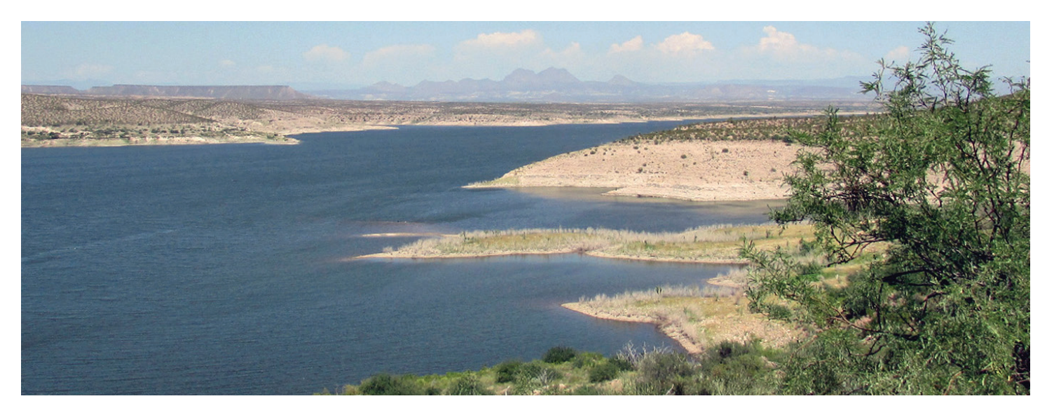
Figure 2. San Carlos Lake looking east from south side. 20 August 2017.

In addition to the Gila River, the San Carlos River empties into the lake from the north. The Apache town of San Carlos was located on the flats near the mouth of the San Carlos until the area was flooded by the lake. The town was relocated about a dozen miles to the north; with more than 4,000 residents, this is now the Nation's largest town (Wikipedia 2017). When the water recedes, the ruins of stone buildings are a reminder of the town that once was there. On the bluff overlooking Old San Carlos, a memorial honors Geronimo and the Apache people. According to an inscription at the site, the two statues were completed in 2009 with funds raised from Apaches throughout the United States.