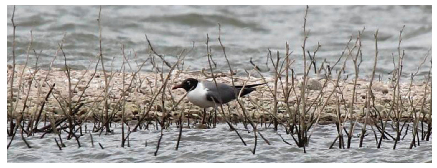
Figure 3. Adult Laughing Gull. 15 May 2015.

Laughing Gull has been documented three times, twice in the spring (Pinal County 30 April 2004 and 15 May 2015) and once in the fall (Pinal and Graham counties 10 November 2013) (Figure 3).