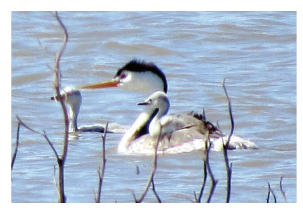
Figure 6. Clark's Grebe with downy young. 9 May 2015.

Surveys conducted from 1993 to 2001 for the Arizona Breeding Bird Atlas detected grebes at the lake, but found no evidence of breeding (Corman and Wise-Gervais 2005). Survey teams and other birders may have visited the lake when nesting wasn't occurring, as breeding has been confirmed numerous times in the past dozen years. The first report was of two family groups of Western Grebe and two of Clark's Grebe on the south side of the lake 3 July 2005. Since then, downy young, including some on the backs of adults, have been reported between May and August in some years (Figure 6). Most noteworthy was the discovery of an estimated 100 nests of Aechmophorus grebes in shallow water among flooded tamarisk clumps 16 July 2015. At least 10 of the nests were positively identified as Clark's, although there were likely more. No young were observed, but