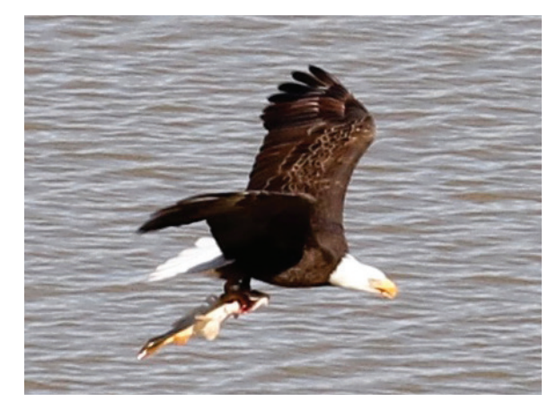
Figure 5. Bald Eagles are often seen foraging at the lake. 30 January 2017.